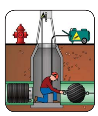
2) Attach Jet-Ball® to tag line and inflate