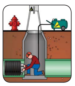
1) Install plug to isolate manhole