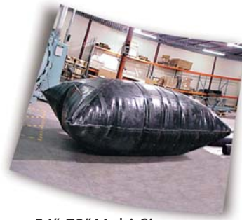
54"-72" Multi-Size Rubber Test-Ball® Plug