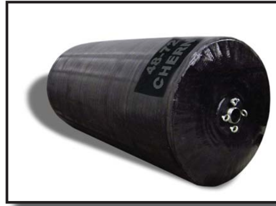
Bendable to 90 degrees