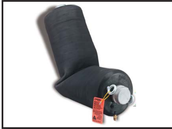
Bendable to 90 degrees